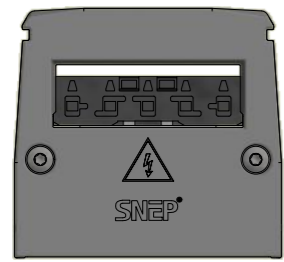
B ( 1 : 2 )

KytKentä pistoliittimiin (IP20): Läp johdotus (5x2,5mm 2 ). Toisesta päädyssä esiasennettu läp johdotuskaapeli (Wago Winsta Midi uroskaapeli) sekä toisessa päädyssä integroitu 5-napainen naarasliitin (ns. kytKentäpäätY). Connection to point connectors (IP20): Through-wiring (5x2,5mm 2 ). Preinstalled Wago Winsta Midi cable (male) and an integrated Wago Winsta Midi female connector in the other end of the luminaire (connector end).