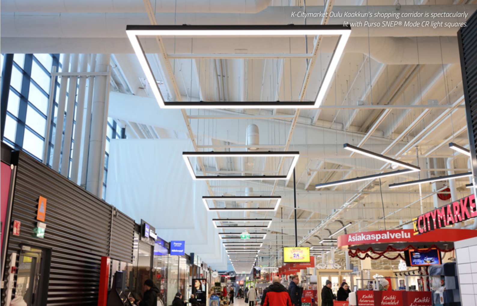
K-Citymarket Oulu Kaakkuri's shopping corridor is spectacularly lit with Purso SNEP® Mode CR light squares.