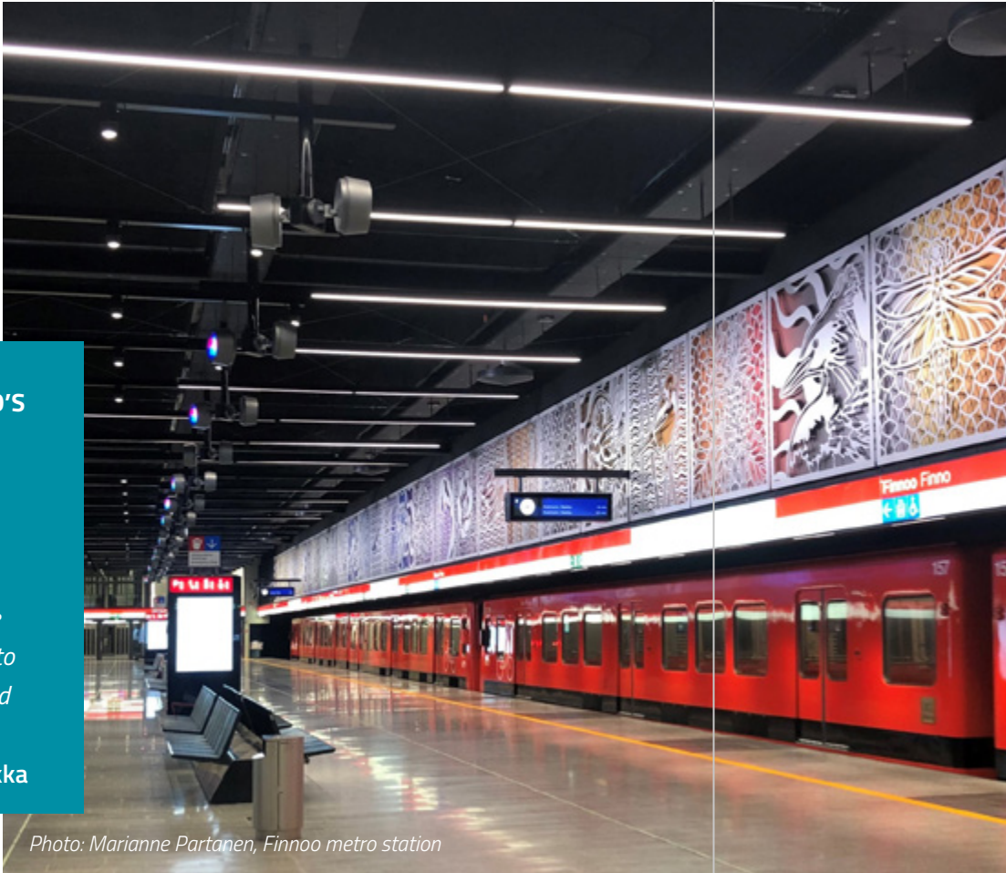
Finnoo metro station