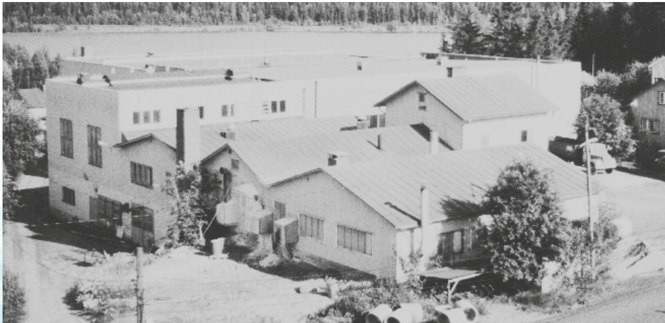
Purso is a Finnish, financially sound family business whose core competence is the design and manufacture of aluminium solutions. The picture shows Purso's production building in 1979.