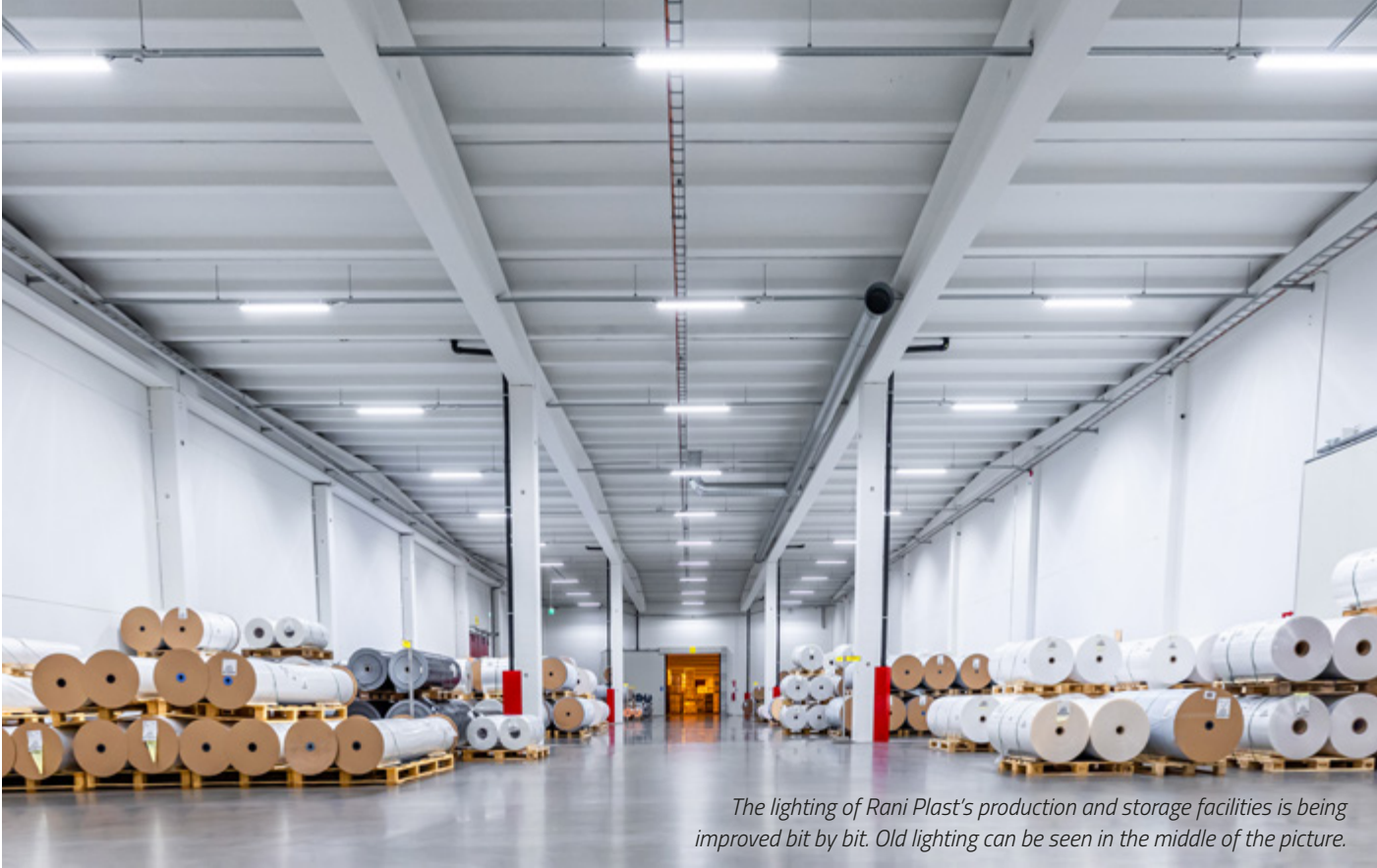
The lighting of Rani Plast's production and storage facilities is being improved bit by bit. Old lighting can be seen in the middle of the picture.

The products marked in the table are our recommended solutions from Purso's selection 1/2023. You can see the current supply on our website: purso.fi